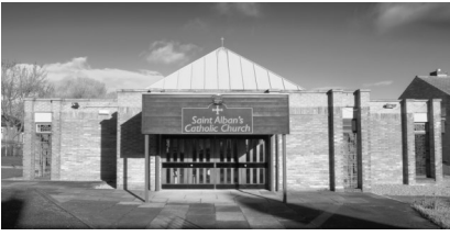
St. Alban at Pelaw