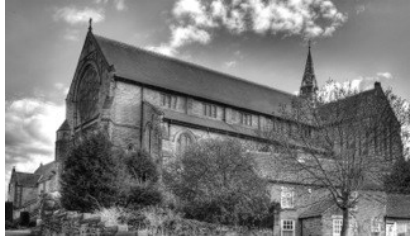
St. Patrick at Felling