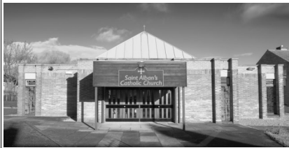
St. Alban at Pelaw