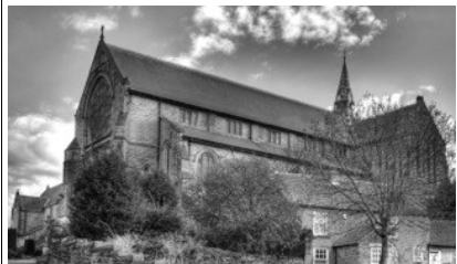
St. Patrick at Felling