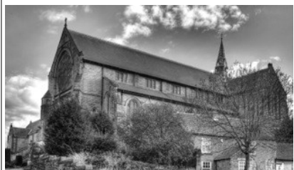
St. Patrick at Felling