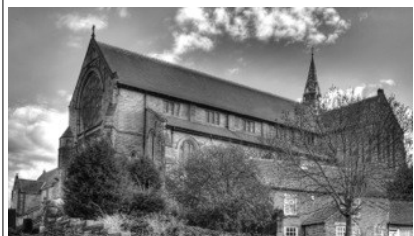
St. Patrick at Felling