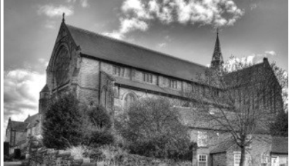
St. Patrick at Felling