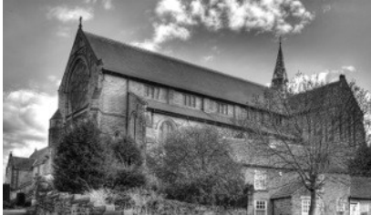
St. Patrick at Felling