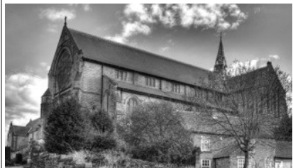
St. Patrick at Felling