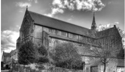
St. Patrick at Felling