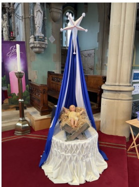
Christmas Nativity St. Patrick's Church 2021

In Gateshead in the week 28th Dec to 3rd Jan there were 4409 recorded cases, which was an increase of 2391 from the previous week. This equates to 2183 cases per 100,000 people. The average area in England had 1,758 cases over the same period.