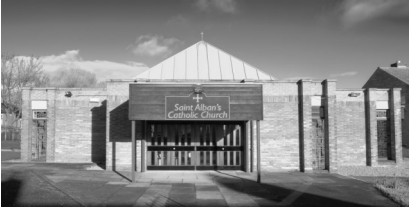
St. Alban at Pelaw