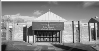
St. Alban at Pelaw