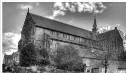
St. Patrick at Felling