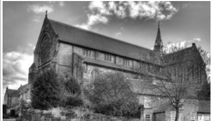
St. Patrick at Felling