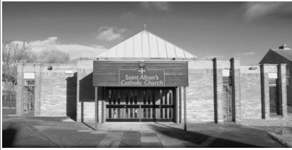
St. Alban at Pelaw