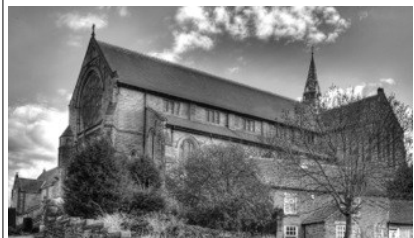
St. Patrick at Felling