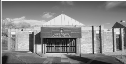
St. Alban at Pelaw