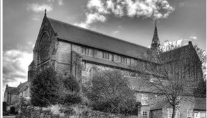
St. Patrick at Felling