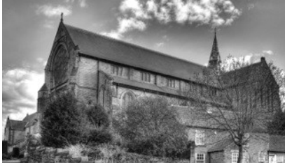
St. Patrick at Felling