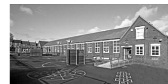
Our School at Pelaw