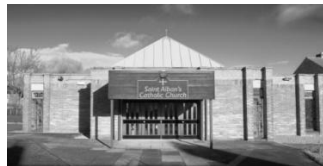
St Alban's at Pelaw