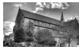
St Patrick's at Felling