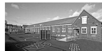
Our School at Pelaw