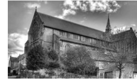
St Patrick's at Felling