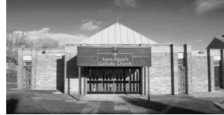
St Alban's at Pelaw