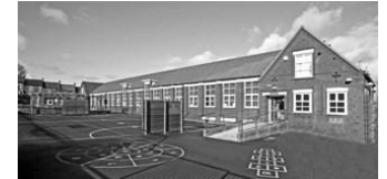
Our School at Pelaw