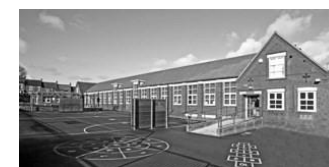
Our School at Pelaw