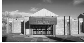
St Alban's at Pelaw