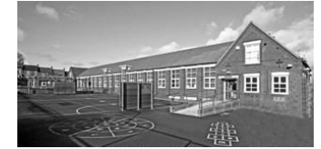
Our School at Pelaw