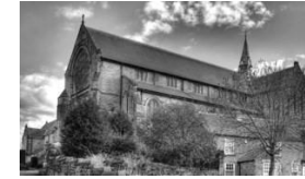
St Patrick's at Felling